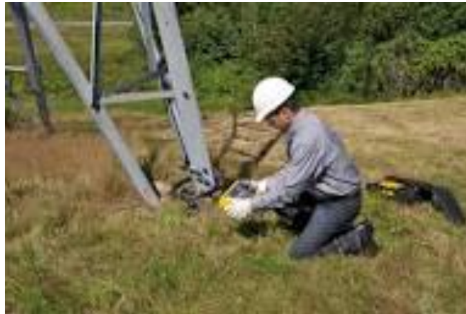
Field inspection and earth-resistance testing of lightning protection systems, carried out to international standards

An independent reference for verifying lightning protection integrity to international standards