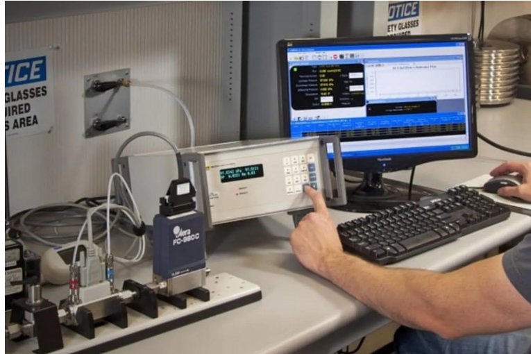
Comparison calibration of flow meters and transmitters against traceable reference rigs and master meters

Traceable flow calibration with documented measurement uncertainty – in the laboratory and on the customer's site