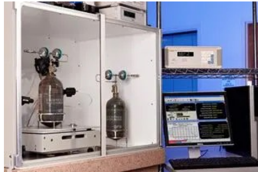
Laboratory rigs and portable equipment cover oil & gas, water, food & beverage and process industries