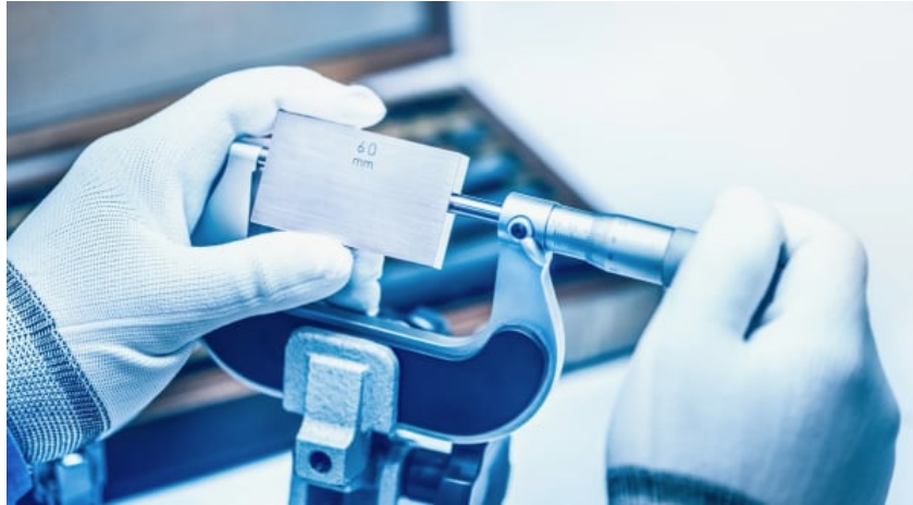
Comparison calibration of dimensional and mechanical instruments against traceable reference standards

Traceable calibration of length, force, torque and mass instruments with documented measurement uncertainty