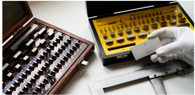
Certified dimensional standards for precision measurement and calibration