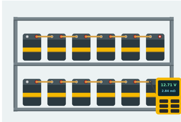
Field testing of stationary battery banks and backup power systems, carried out to international maintenance standards

An independent reference for verifying stored-energy and standby power reliability to international standards